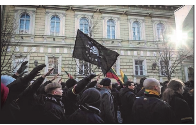
Participants of the march demonstrate Nazi salute (Vilnius, March 11, 2013).

According to the findings of the international movement World without Nazism, neo-Nazis manifestations in Lithuania became the most widespread form of street celebrations.