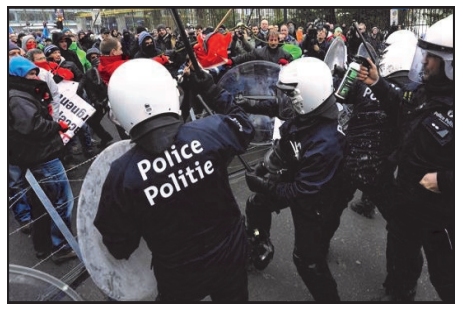
Crackdown of the protest of ArcelorMittal workers (Brussels, January 25, 2013).

According to the statistics of the Standing Police Monitoring Committee, known as Committee P, published by the newspaper Le Soir in February 2013 the number of complaints against police is constantly growing (2405 in 2009, 2451 in 2010, 2688 in 2011) despite the simplified methodology of their recording (previously an investigation was conducted on each complaint, currently a case is open only if numerous complaints refer to the same incident). One-quarter of all complaints concerns the use of force (beating) by police officers. In 2010, only 11 law enforcement officials were found guilty of beating and degrading treatment of victims.