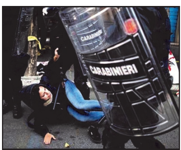
Rally crackdown and arrests of protesters against unemployment (Rome, October 19, 2013).

June 5, 2013 Terni: the police used rubber batons to stop the participants of a trade union's protest, workers of local steel plant, from blocking railway near the railway station. Several protestors, including the mayor Leopoldo Di Girolamo, were cruelly beaten by the police.