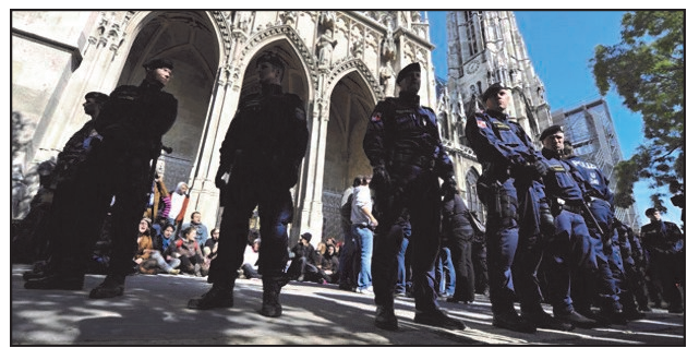
The police surrounded the Votivskirche church building just before the crack down of the protest (Vienna, September 22, 2013).

The Committee on the Rights of the Child in its concluding observations on the 3rd and 4th periodic reports of Austria expressed its deep concern that prisons where juveniles are deprived of their