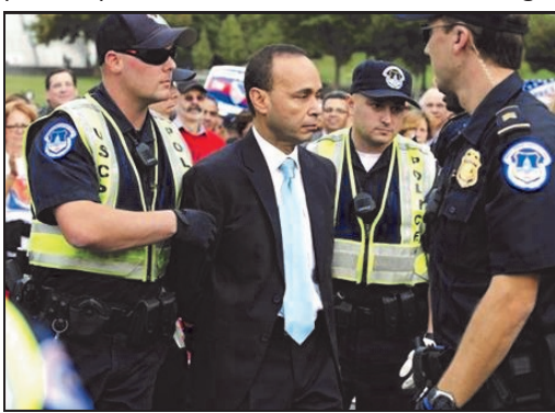
Luis Gutierrez is arrested by U.S. Capitol Police officers on Capitol Hill during a immigration rally (Washington, October 8, 2013).

October 8, 2013 Washington, DC: 200 people, including eight Democratic members of the House of Representatives were arrested during a massive rally seeking to push Republicans to hold a vote on an immigration reform bill and to pass it.