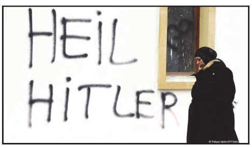
Right-wing extremism is on the rise in the Czech Republic

Segregation of Roma children continues in the Czech Republic. Disproportionally large number of Roma children are placed into substandard schools with simplified curricular for mildly disabled children