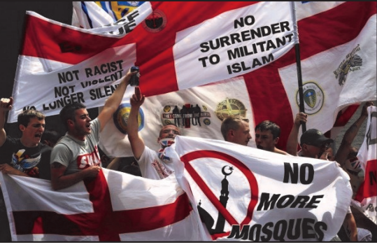
Supporters of the English Defense League take part in the anti-Muslim demonstration (Birmingham, July 20, 2013).

During the second cycle of the wermuth Universal Periodic Review in the UN Human Rights Council in