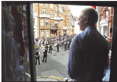
Julian Assange, Australian journalist, founder of Wikileaks, more than a year and a half has been actually holding in detention inside the Embassy of Ecuador that had granted him a political asylum (London, August 19, 2012).

information According to the published in November in the German magazine Der Spiegel with reference to the data provided by Edward Snowden, GCHQ had been monitoring hotel bookings in more than 350 hotels around the world in order to know the hotels where foreign diplomats and members governmental delegations staved during their visits. The Headquarters' specialists could wiretap the hotel room telephone, computer which the surveillance object used. A special program «Royal Concierge» elaborated in order to monitor online bookings. The secret service agents could also place diplomats and foreign