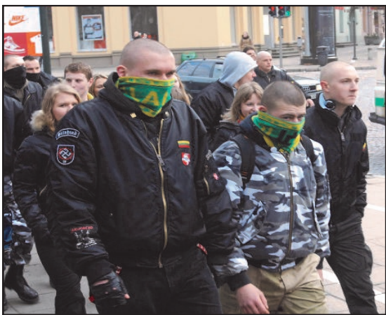
Lithuanian neo-Nazis took part in the march (Vilnius, March 11, 2013).