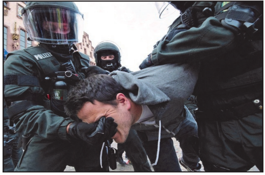
Arrest of the participators of the protest «Blockupy Frankfurt» (Frankfurt, June 1, 2013).

The SWAT groups broke up a crowd to arrest some most active protesters (about 1,000 people). The SWAT groups used brutal force and special means (tear gas, batons).